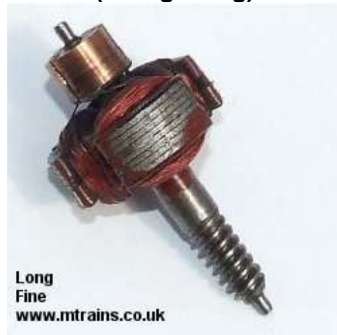
Long Fine www.mtrains.co.uk