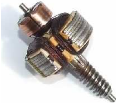
Short, N2 Fine www.mtrains.co.uk