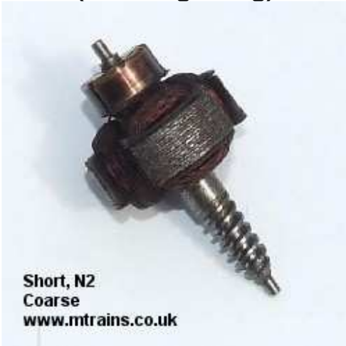
Short, N2 Coarse www.mtrains.co.uk