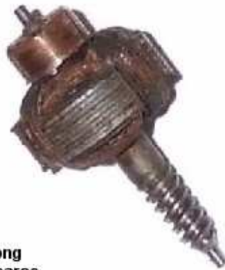
Long Coarse www.mtrains.co.uk